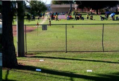
Site 3. East side of Ballfield #1 west of bullpen.