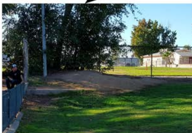
Site 8. Dirt area in corner adjacent to Emmaus Lutheran School and playground.