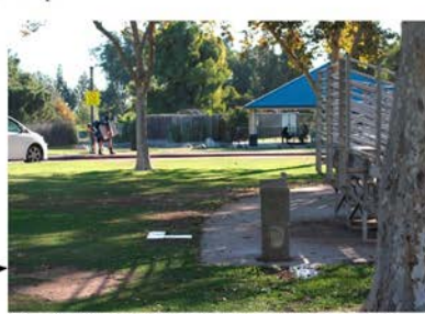
Site 4. Behind bleachers near home team dugout (north side) for Ballfield #1.