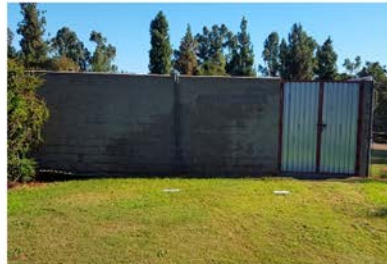
Site 5. Adjacent to city utility enclosure east end of duck pond.