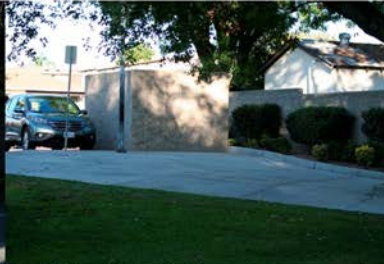
Site 2. Outside trash bin enclosure at north end of Parking lot.