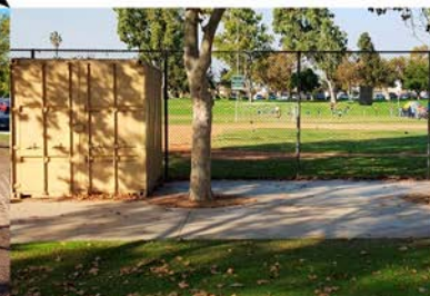
Site 6. Beside existing box, used by others, south of visitor's dugout (east side) for Ballfield #1.