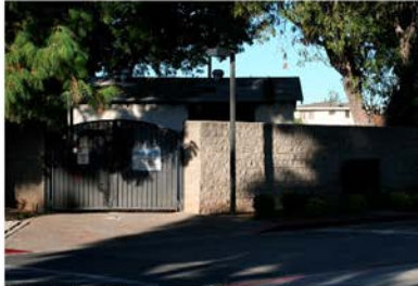
Site 1. Inside city utilities enclosure near park entrance.